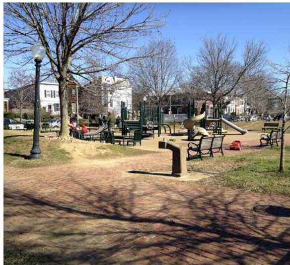
Marion park and playground