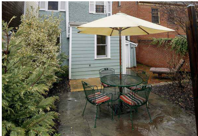
Perfect for grilling and gardening!