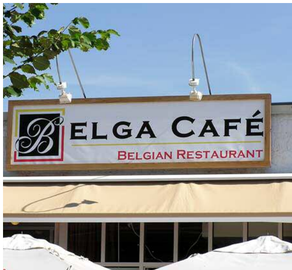
Restaurants galore out the front door