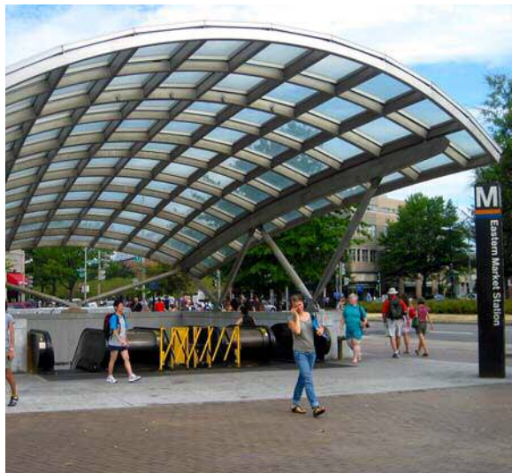
Metro just 2 blocks away