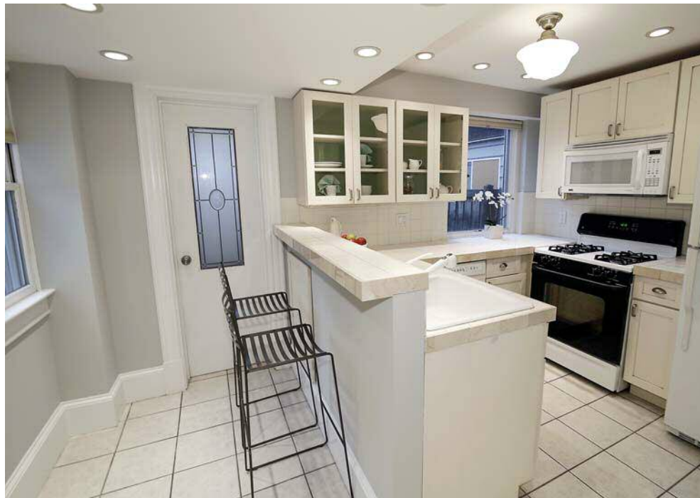
Kitchen with breakfast bar