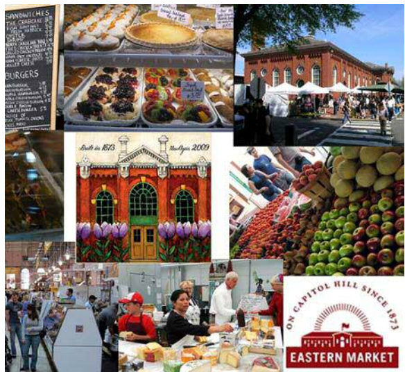
Eastern Market two blocks away!

Restaurants within ¼ mile: 18th Amendment, Banana Café, Belga Café, Café 8, Capitol Hill Tandoor & Grill, Cava Mezze Restaurant, Chipotle, DC-3, Fusion Grill, Hank's Oyster Bar, Hello Cupcake, Kraze Burgers, Las Placitas, Lavagna, Lil Pub, Lola's Barracks Bar & Grill, Matchbox, Molly Malone's, Montmartre, Old Siam Restaurant, Pacifico Cantina, Pizza Boli's, Sanphan Thai, Senart's Oyster & Chop House, Tash House of Kabob, Ted's Bulletin, The Chesapeake Room, The Ugly Mug, Trattori Alberto Coffee: Starbucks, Peregrine Espresso, Le Pain Quotidien, Spring Mill Bread Co., Pound The Hill, Grocery: Yes! Organic Market, Marvelous Market, Eastern Market Other details: Marion Park just a block away – huge, fenced park and playground. Brent Elementary School. Multiple car and bikeshares close by.