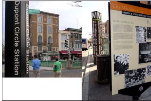
Between 2 metros!