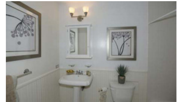
En-Suite Bath #2