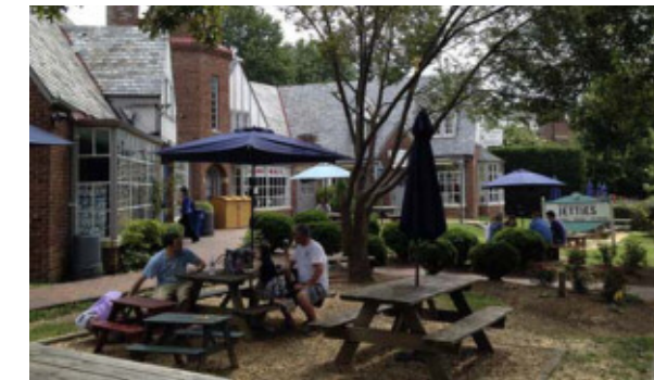
Jetties - just steps away!