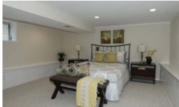
Bedroom #/Rec Room