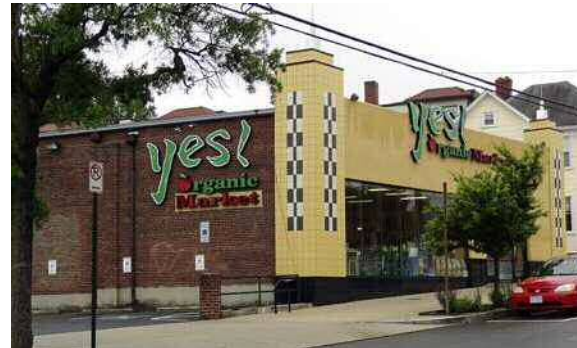
Yes! Organic Grocery 1/2 mile away